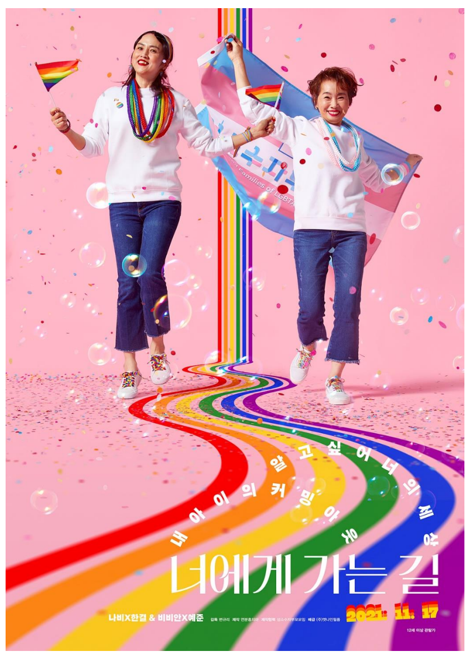
93MIN | KOREAN | 16:9 | COLOR | 5.1SOUND